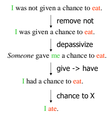
Figure 2: Example simplification

ARG0. An example sentence with extracted path features is shown in Figure 1.